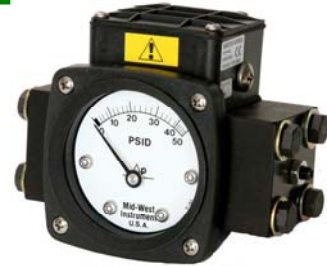
Model 142 shown with “BA” switch option

(2) Reed switches located inside NEMA 4x enclosure with 7 position terminal strip. An opening at rear of enclosure accepts ½” flexible weather-proof or conduit connector (supplied by customer).