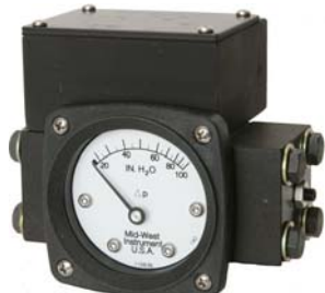
Model 140 shown with “EA” switch option.

(1) Reed switch in general purpose enclosure Division 2 Hazardous locations with 7 position terminal strip. An opening at rear of enclosure accepts ½” flexible weather-proof or conduit connector (supplied by customer).