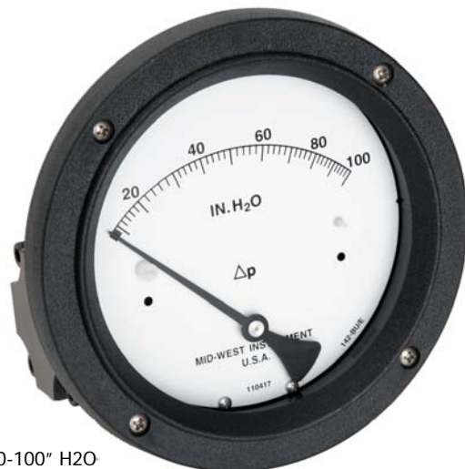
Model 142 0-100" H 2 O with 4-1/2" Dial