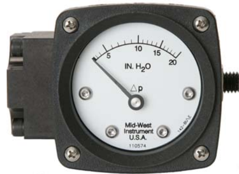
Model 142 0-20" H 2 O with 2-1/2" Dial

Ideally suited for use on dissimilar fluids and wet gas or fluids with a high concentration of solids, etc.