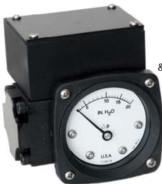
Model 142 with 2-1/2" Dial & 4-20mA Transmitter

“A World Leader in Differential Pressure Gauges, Switches & Transmitters