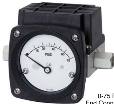
Model 124 0-75 PSID Shown with End Connections & Transmitter

Due to precision sizing of piston and body bore, leakage across piston will not exceed 15 SCFH air at 100 PSID at ambient temperature.