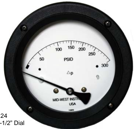
Model 124 0-300 PSID 4-1/2" Dial

Due to precision sizing of piston and body bore, leakage across piston will not exceed 15 SCFH air at 100 PSID at ambient temperature.