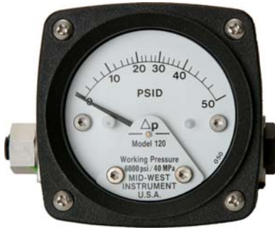
Model 120 0-50 PSID 2-1/2" Dial

A low cost differential pressure gauge for use in measuring the pressure drop across filters, strainers, separators, valves, pumps, chillers, etc., and for local flow indication and control.