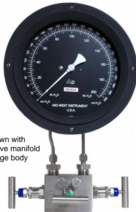
Model 116 shown with Optional S.S. 3-Valve manifold mounted to gauge body