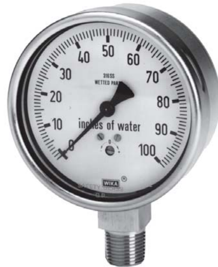
Bourdon Tube Pressure Gauge Model 632.50

Additional error when temperature changes from reference temperature of 68°F (20°C) ±0.6% for every 18°F (10°C) rising or falling. Percentage of span.