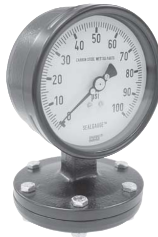
Diaphragm Pressure Gauge Model 422.12

Ambient: -4°F to +140°F (-20°C to +60°C) Medium: +212°F (+100°C) maximum