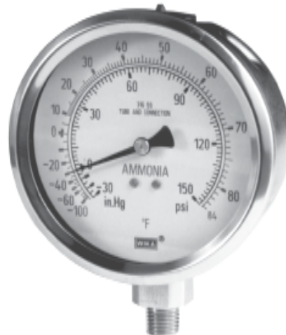
Bourdon Tube Pressure Gauge Model 232.53AM