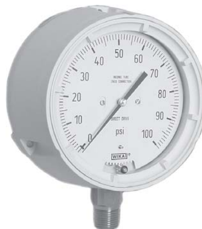
Bourdon Tube Pressure Gauge Model 232.34DD

Additional error when temperature changes from reference temperature of 68°F (20°C) ±0.4% for every 18°F (10°C) rising or falling. Percentage of span.