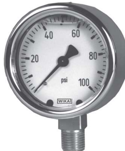
Bourdon Tube Pressure Gauge Model 213.40

Medium: max. +140°F (+60°C) - soldered system max. +212°F (+100°C) - brazed system