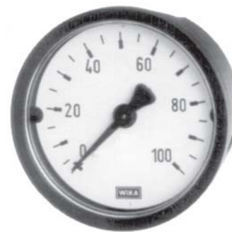
Bourdon Tube Pressure Gauge Type 111.16

Material: Copper alloy 1/8" or 1/4" NPT center back mount (CBM)