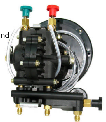
"New" Manifold Design