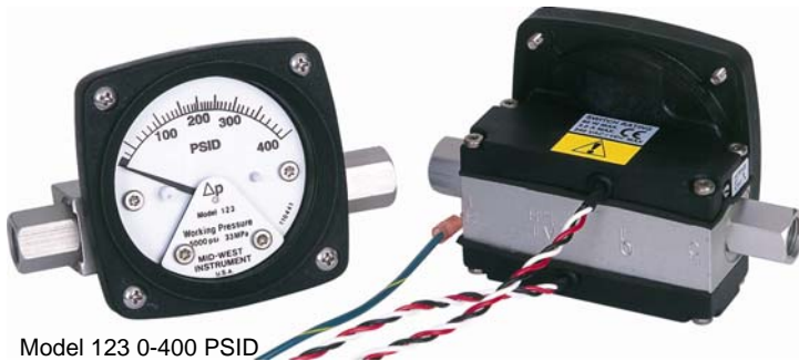
Model 123 0-400 PSID Shown with 2 Std. Switches

Due to precision sizing of piston and body bore, leakage across piston will not exceed 15 SCFH air at 100 PSID at ambient temperature.