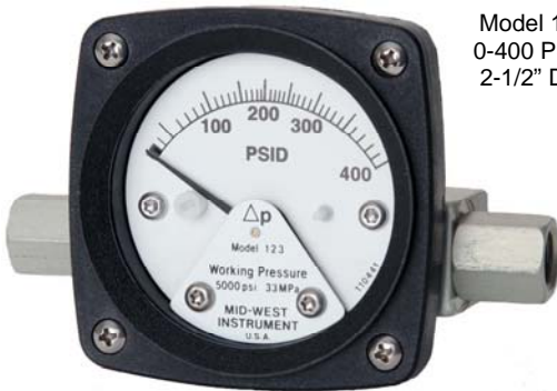
Model 123 0-400 PSID 2-1/2" Dial