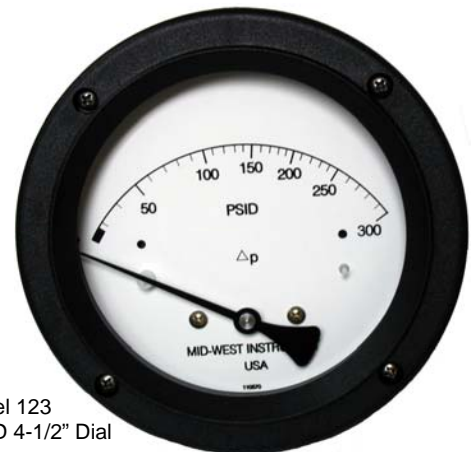
Model 123 0-300 PSID 4-1/2" Dial

An optional maximum indication follower pointer provides automatic indication of maximum differential occurring during a time period or system cycle. Reversed pressure ports are optionally available to facilitate installation and readability depending on which side of a filter, etc., the instrument must be installed.