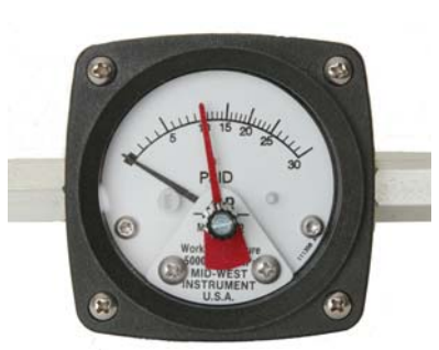
Model 122 0-30 PSID 2-1/2" Dial w/Maximum Follower Pointer

Due to precision sizing of piston and body bore, leakage across piston will not exceed 15 SCFH air at 100 PSID at ambient temperature.