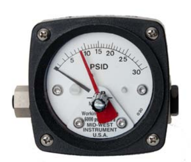
Model 120 0-30 PSID With Maximum Follower Pointer