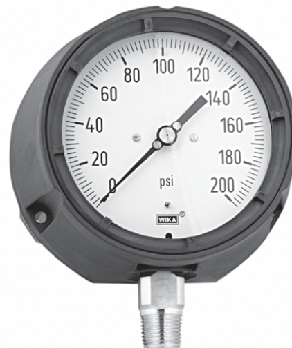
Bourdon Tube Pressure Gauge Model 222.34

Additional error when temperature changes from reference temperature of 68°F (20°C) ±0.4% for every 18°F (10°C) rising or falling. Percentage of span.