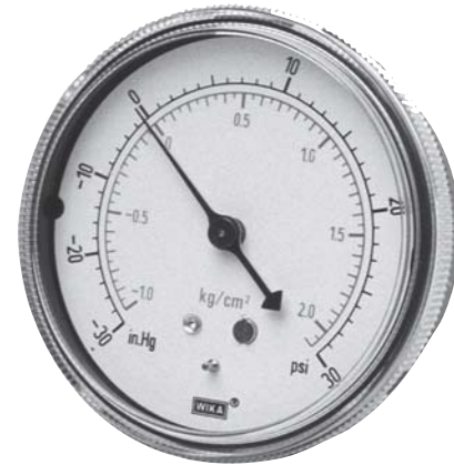
Bourdon Tube Pressure Gauge Type 111.11PM

Material: copper-alloy 1/8" or 1/4" NPT center back mount (CBM)